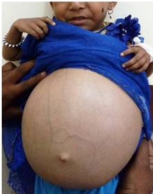
Gaucher disease: untreated

Enzyme replacement therapy: For affected children, a specific treatment called Enzyme Replacement Therapy (ERT) is available for the treatment of GD Type I and most cases of Type III. The missing enzyme is given as an intravenous injection every fifteen days. This treatment needs to be given lifelong. The best results are seen when a child is begun on treatment early. The majority of affected children respond well to ERT and improvement is seen within six months of starting treatment. Many children who have been treated appropriately grow up to be able, working individuals and may even become professionals like engineers, doctors etc. They can also get married and have healthy children of their own.