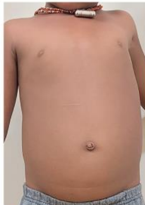
Gaucher disease: after 2yrs of ERT